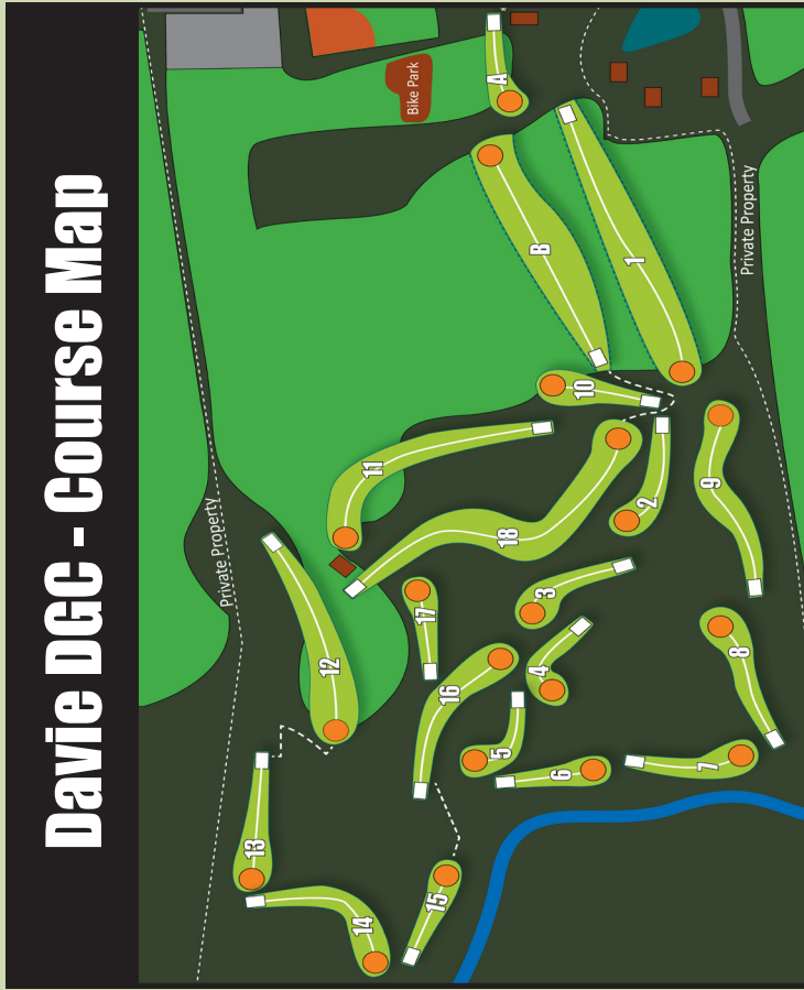
Davie DGC - Course Map

Rules: Complete each hole in the fewest number of throws by starting at the tee-pad and finishing with your disc in the basket. Each consecutive shot must be taken from where your previous shot landed. If your disc lands in the creek, crosses a fenceline, or lands in an OB zone, you're Out-of-Bounds. Penalize yourself one stroke, and throw from where your disc was last in-bounds. Safety: Disc golf discs can cause serious damage to people and property. You are responsible for any damages caused by your disc. Be aware of your surroundings and be patient of others. Do not stand in front of other players who are throwing, and don't throw when other players are in front of you!