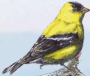
American Goldfinch Carduelis tristis "per-chik-o-ry"