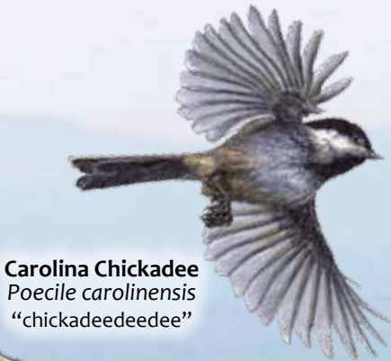
Carolina Chickadee Poecile carolinensis "chickadeedeede"

Look into the trees. How many different birds can you find? _____ What parts of the tree are the birds using? _____