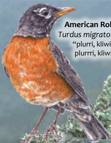
American Robin Turdus migratorius "plurri, kliwi, plurri, kliwi"

How many different birds can you find? _____ Can you tell what they are eating? _____