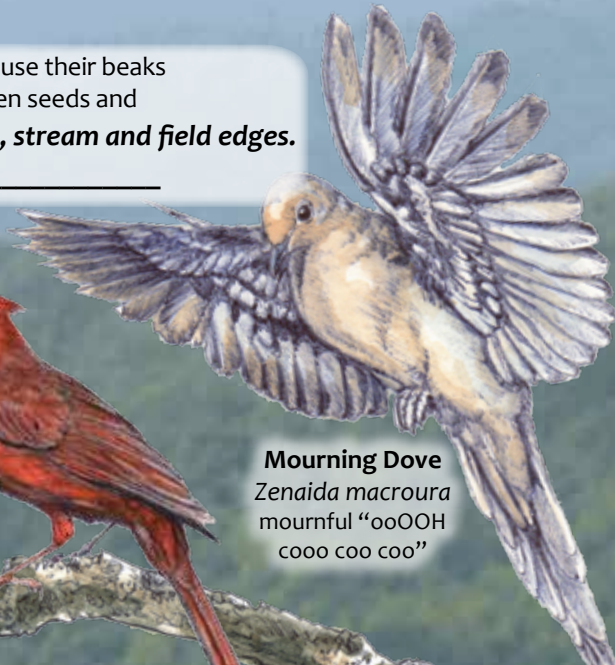
Mourning Dove Zenaidura macroura mournful "ooOOH cooo coo coo"