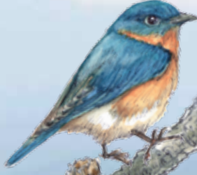
Eastern Bluebird Sialia sialis soft, low-pitched "tu-a-wee"