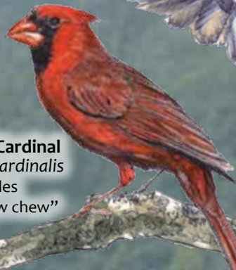
Northern Cardinal Cardinalis cardinalis whistles "chew chew chew"