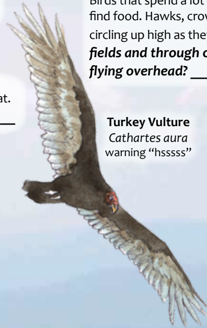
Turkey Vulture Cathartes aura warning "hsssss"

Birds that spend a lot of time in the air use their strong eyesight to find food. Hawks, crows and vultures can usually be found perched or circling up high as they search for their next meal. Scan the sky over fields and through openings in the trees. Are there any large birds flying overhead? _____ Are they flapping or gliding? _____