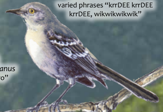
Northern Mockingbird Mimus polyglottos varied phrases "krrDEE krrDEE krrDEE, wikwikwik"