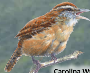
Carolina Wren Thryothorus ludovicianus "pidaro pidaro pidaro"