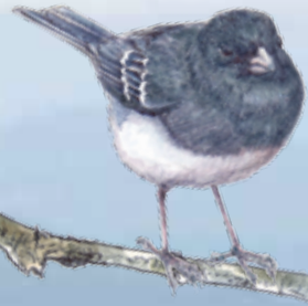
Dark-eyed Junco Junco hyemalis musical trill of 7-23 notes