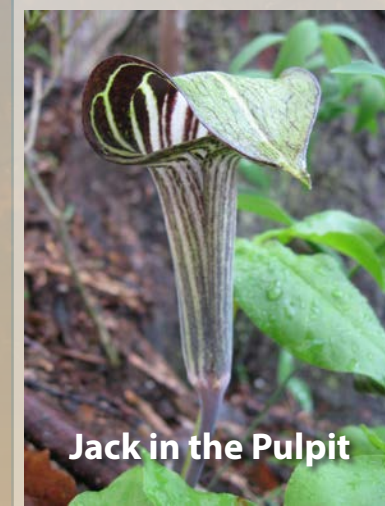
Jack in the Pulpit

There are certain wildflowers that are adapted to grow in soils that are cleared and renewed by fire. Below are a few examples. Can you find any of these blooms along the trail in spring or summer?