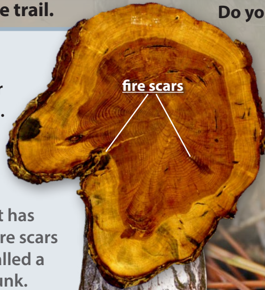
A 'catface' fire scar

Epicormic branches are shoots that grow directly from the trunk of a tree. These can sprout to life out of injuries from fire.