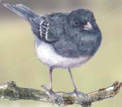
Dark-eyed Junco Junco hyemalis