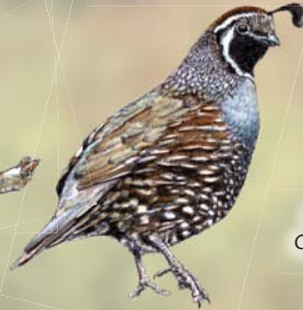
California Quail Callipepla californica