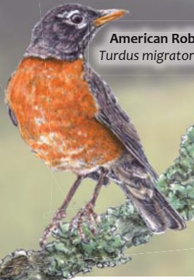
American Robin Turdus migratorius

Birds that feed on the ground usually specialize in catching bugs or finding seeds. American Robins use their beaks to pull earthworms from the ground. Juncos scratch through leaves to uncover fallen seeds and berries. California Quails peck insects and seeds from gravelly areas. Check the ground near trail, stream and field edges. How many different birds can you find? _____ Can you tell what they are eating? _____