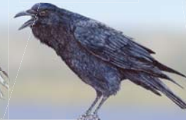
Common Raven Corvus corax