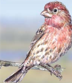
House Finch Haemorhous mexicanus