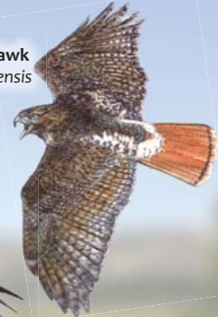
Red-tailed Hawk Buteo jamaicensis