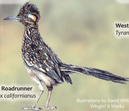
Greater Roadrunner Geococcyx californianus