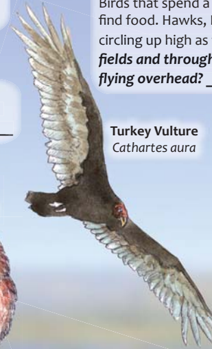
Turkey Vulture Cathartes aura

Birds that spend a lot of time in the air use their strong eyesight to find food. Hawks, Ravens and vultures can usually be found perched or circling up high as they search for their next meal. Scan the sky over fields and through openings in the trees. Are there any large birds flying overhead? _____ Are they flapping or gliding? _____