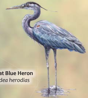
Great Blue Heron Ardea herodias