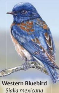
Western Bluebird Sialia mexicana