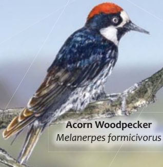
Acorn Woodpecker Melanerpes formicivorus

Almost all the birds of Lake Morena use trees and shrubs for food, shelter, or nesting. Woodpeckers make their nests in the cavities of trees and pick insects from the bark. Trees can provide seeds and berries for birds such as Western Bluebirds and House Finches to eat. Look into the trees. How many different birds can you find? _____ What parts of the tree are the birds using? _____