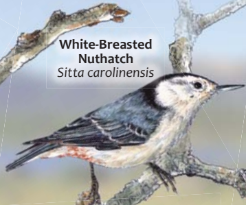
White-Breasted Nuthatch Sitta carolinensis