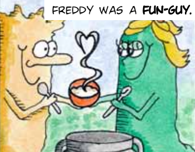
..SHE WAS COOKING SUGAR THROUGH THE PROCESS OF PHOTOSYNTHESIS.