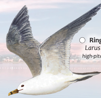
Ring-billed Gull Larus delawarensis high-pitched, rising squeal