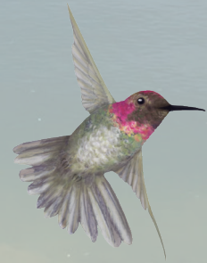
Anna's Hummingbird Calypte anna a series of buzzes, whistles, and chip sounds