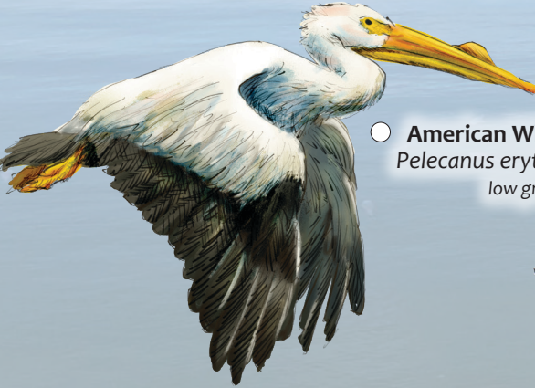
American White Pelican Pelecanus erythrorhynchos low grunts