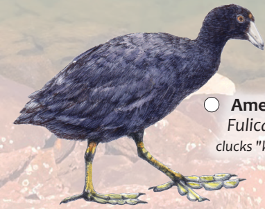
American Coot Fulica americana clucks "krrrp" or "pri-KI"