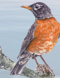
American Robin Turdus migratorius whistles a string of "cheerily, cheer up, cheer up"