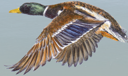
Mallard Anas platyrhynchos "quack quack"