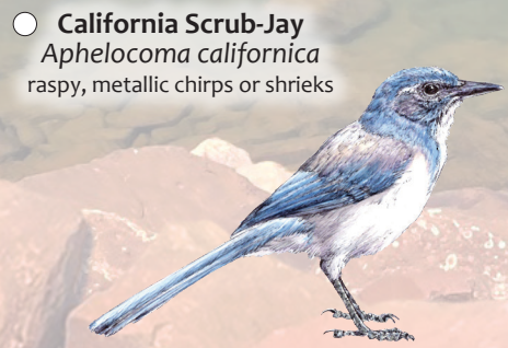
California Scrub-Jay Aphelocoma californica raspy, metallic chirps or shrieks