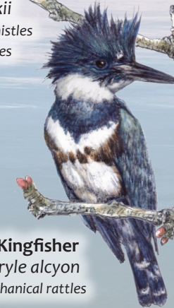
Belted Kingfisher Megaceryle alcyon harsh, mechanical rattles