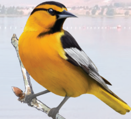
Bullock's Oriole Icterus bullockii rhythmic notes of whistles and scratchy rattles