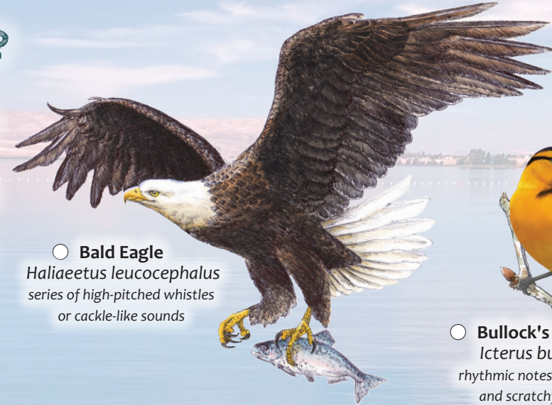
Bald Eagle Haliaeetus leucocephalus series of high-pitched whistles or cackle-like sounds

Check off the birds you find on your adventure!