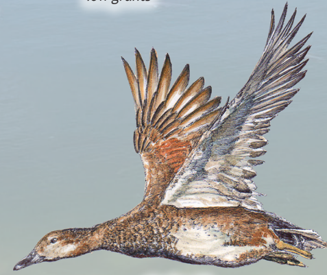
Gadwall Mareca strepera short, deep reedy calls and high whistles