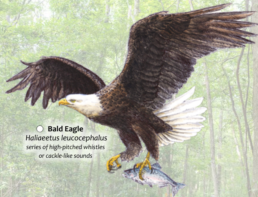
Bald Eagle Haliaeetus leucocephalus series of high-pitched whistles or cackle-like sounds

Whether perched along the bank, wading in the water, or flying overhead, there are many birds to observe at Rosebrock Park. Use this brochure to learn about the birds that call this place home and see how many you can find on your hike!