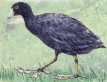
American Coot Fulica americana clucks "krrrp" or "pri-KI"