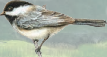
Black-capped Chickadee Poecile atricapillus "chicka-dee-dee-dee"