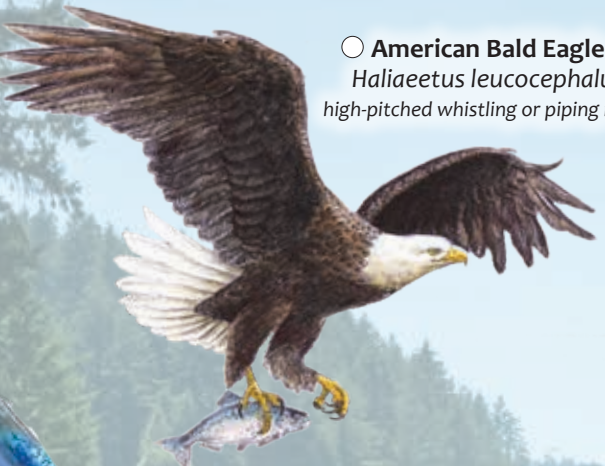
American Bald Eagle Haliaeetus leucocephalus high-pitched whistling or piping notes