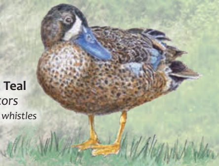
Blue Winged Teal Spatula discors series of high pitch whistles