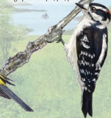
Downy Woodpecker Dryobates pubescens high pitched "pik, pik, pik"