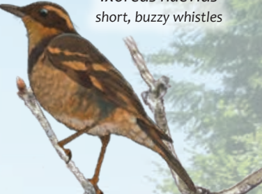
Varied Thrush Ixoreus naevius short, buzzy whistles