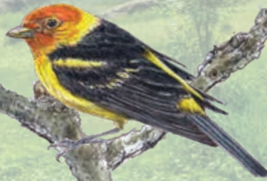
Western Tanager Piranga ludoviciana hoarse "cheerup, cheerily"