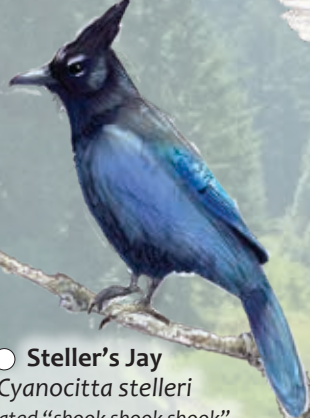
Steller's Jay Cyanocitta stelleri repeated "shook shook shook"