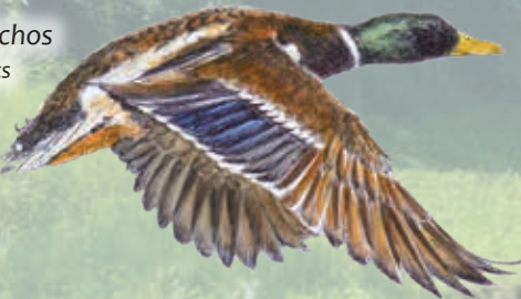
Mallard Anas platyrhynchos series of quacks