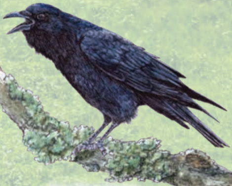
American Crow Corvus brachyrhynchos "caw, caw, caw"