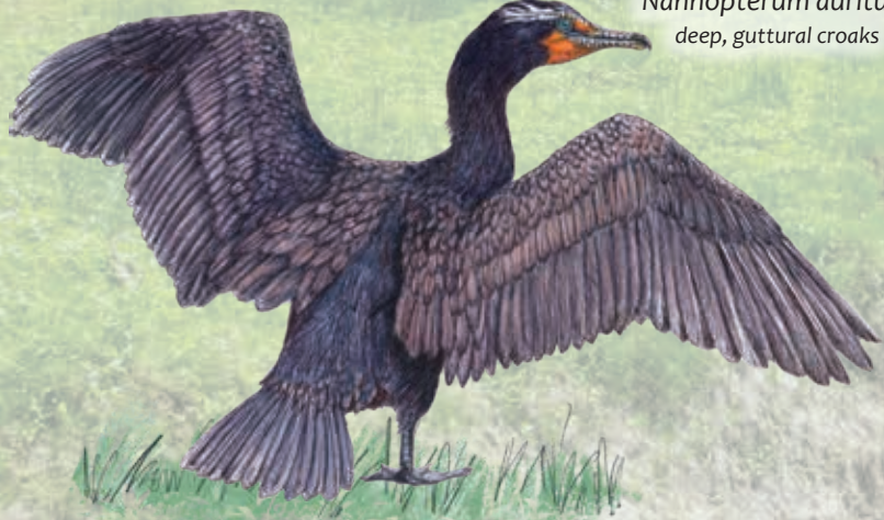
Double-crested Cormorant Nannopterum auritum deep, guttural croaks